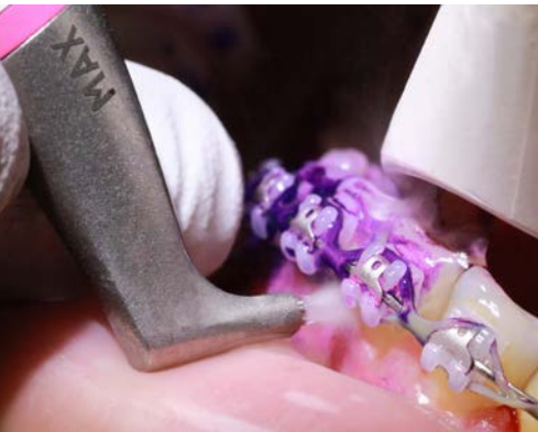
Figure 3: State-of-the-art prevention utilizes Airflow Max: this effective and at the same time particularly gentle method is suitable for biofilm management on all oral tissues as well as on restorations, implant components, and fixed orthodontic appliances.

(PMPR) as well as in secondary and tertiary supportive periodontal therapy (SPT). 6,7,9-11