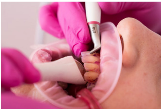
Fig. 2: State-of-the-art prevention utilizes AIR-FLOWING®: this effective yet particularly gentle method is suitable for biofilm management of all oral tissues as well as of implants and restorations.