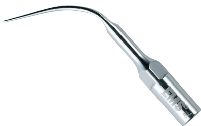
Image 2: The PIEZON® No Pain PS Instrument recommend for use in 95% of ALL cases

For special situations like extremely hard calculus, EMS has dedicated and efficient instruments. The PIEZON® P Instrument is mainly used for the removal of stubborn, hard sub- and supragingival calculus and concretions in all quadrants, up to 4 mm only. The PIEZON® PSR and PSL Instruments are recommended for difficult-to-reach distal and mesial interproximal surfaces with superior efficacy and comfort, subgingival and supragingival, up to 8 mm. The PIEZON® PSR & PSL Instruments feature superior efficacy in heavy calculus removal compared to the PIEZON® PS NO PAIN Instrument. They save time, especially during initial periodontal therapy and are indicated for adult patients only. The PIEZON® PI Instrument features a tip-coating made of high-tech Polyether Ether Ketone (PEEK) fiber that safely cleans the sensitive surfaces of implant abutments and restorations. It easily debrides plaque with surgical precision thanks to its linear movements and medical-grade stainless steel. It's ideal for minimally invasive implant maintenance and for maximum patient comfort.