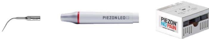
Image 1: The PIEZON® No Pain Trilogy: PIEZON® No Pain Module, PIEZON® No Pain Handpiece and PIEZON® No Pain Instrument. All must be used in perfect unison to achieve the PIEZON® No Pain effect.

The PIEZON® No Pain module, handpieces and instruments trilogy can be integrated into almost any dental unit on the market or ordered as a factory fitted option. PIEZON® No Pain technology is an intelligent feedback system that detects the resistance on the instrument while scaling and automatically increases or decreases the power of vibration. We know surface damage increases when working with high lateral pressure. With PIEZON® technology there is no temptation to push on the calculus. Clinicians simply apply the instrument and let the vibration do the job for them, saving their hands and wrists. The technology helps clinicians deliver high quality care, effectively with the absence of any pain or discomfort to the patient.