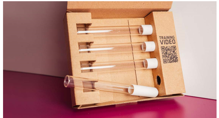
Image 4: The PIEZON® PS Training Tool to perfect your PIEZON® skills.

EMS hosts dedicated PIEZON® and ergonomics Swiss Dental Academy training courses. Thanks to these training courses, your entire team is trained in the application of PIEZON® to ensure successful, standardized treatments. Visit https://professional.airflowdentalspa.com.au/education-training/swiss-dental-academy/ to view our latest training courses. The 2022 calendar will be announced shortly.